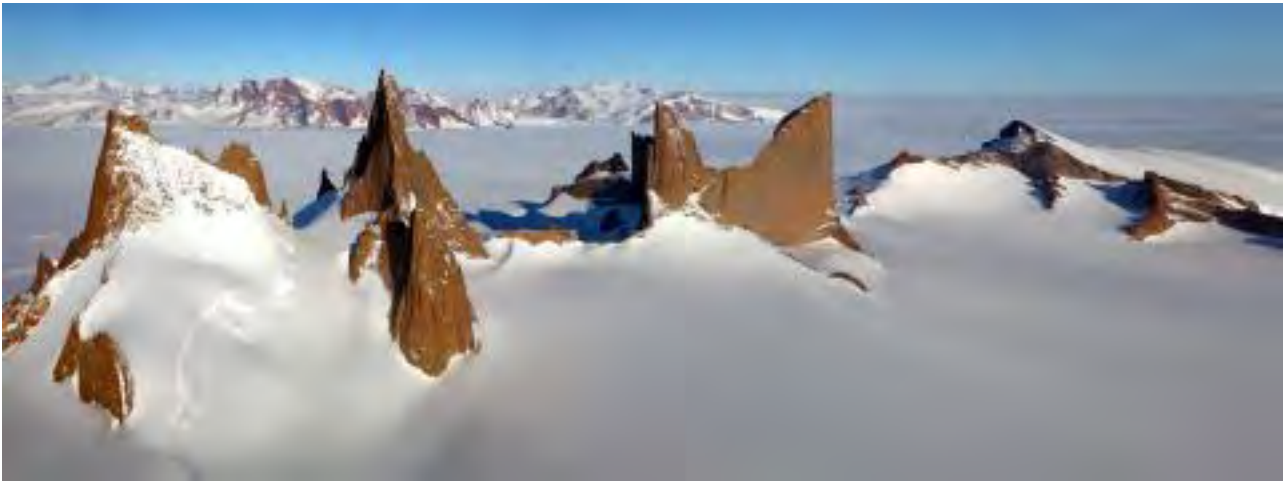
Mountains of Queen Maud Land

IMPORTANT NOTICE: We recommend clients arrive in Cape Town not later than 2 days before the scheduled date of departure for Antarctica. Depending on prevailing Antarctic weather patterns, the flight may depart up to one day earlier than scheduled. Also, once in Antarctica, the listed activities may be changed in reaction to varying weather conditions.