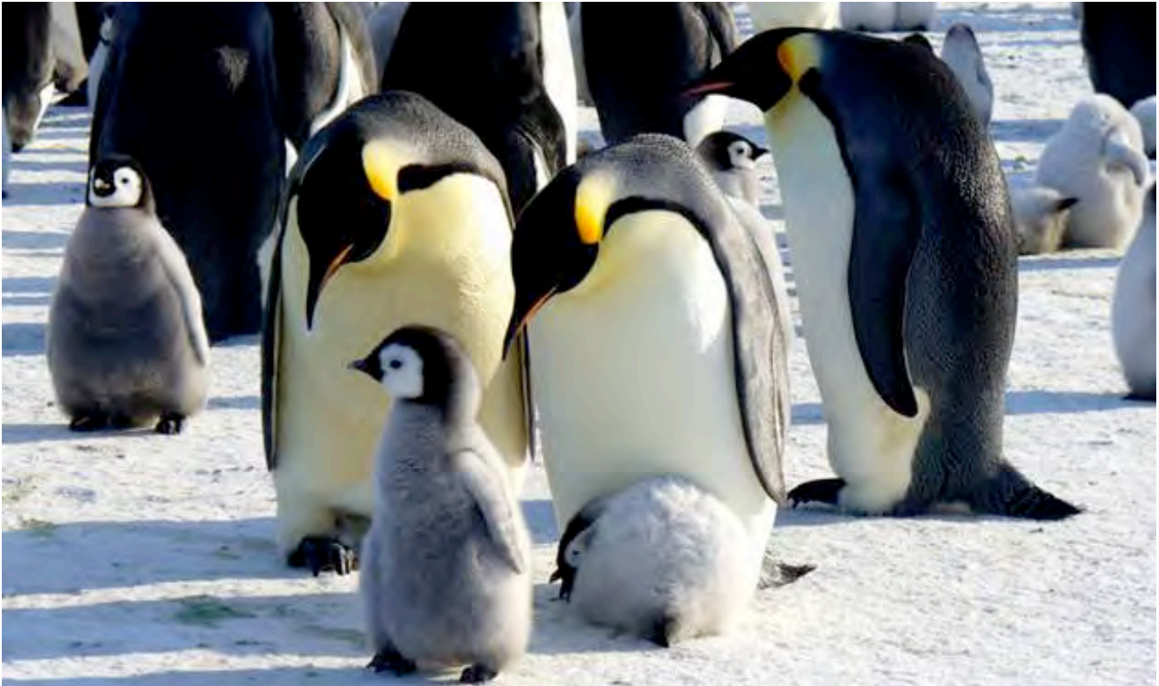
At the Emperor Penguin Colony

Later in the evening we will fly back to the airbase and return to our guest house where you can relax, sit together with a cup of hot tea or enjoy a glass of excellent South African wine and talk about the impressions of the day. After that you are welcome to the Russian Antarctic sauna.