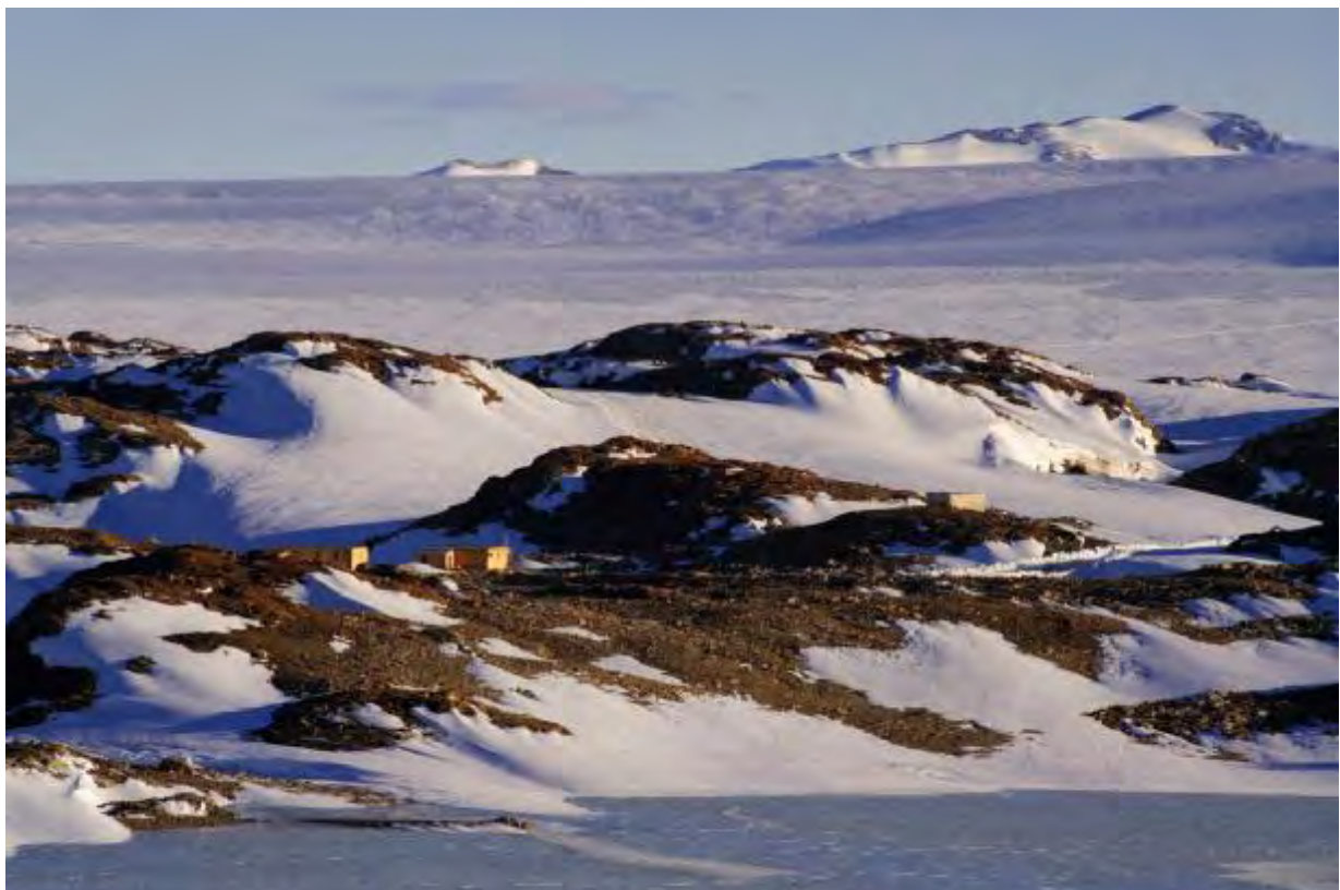
Guesthouse in the Schirmacher Oasis

After landing you collect your luggage and follow your guide to the heated tent of the airbase where you will be served breakfast. Following this we bring you to our guesthouse called Oasis , where you are accommodated. Situated on Schirmacher Oasis , an ice-free area 14km from the runway, the wooden houses of our Oasis are warm and cosy and offer heated rooms, amenities and a Russian sauna. After your long overnight flight you have time to sleep or relax until 2pm. At this time we invite you for lunch followed by a visit to the permanent research station, Novolazarevskaya (Novo), You will have a chance to speak to the scientists and learn about life and work at an Antarctica base.