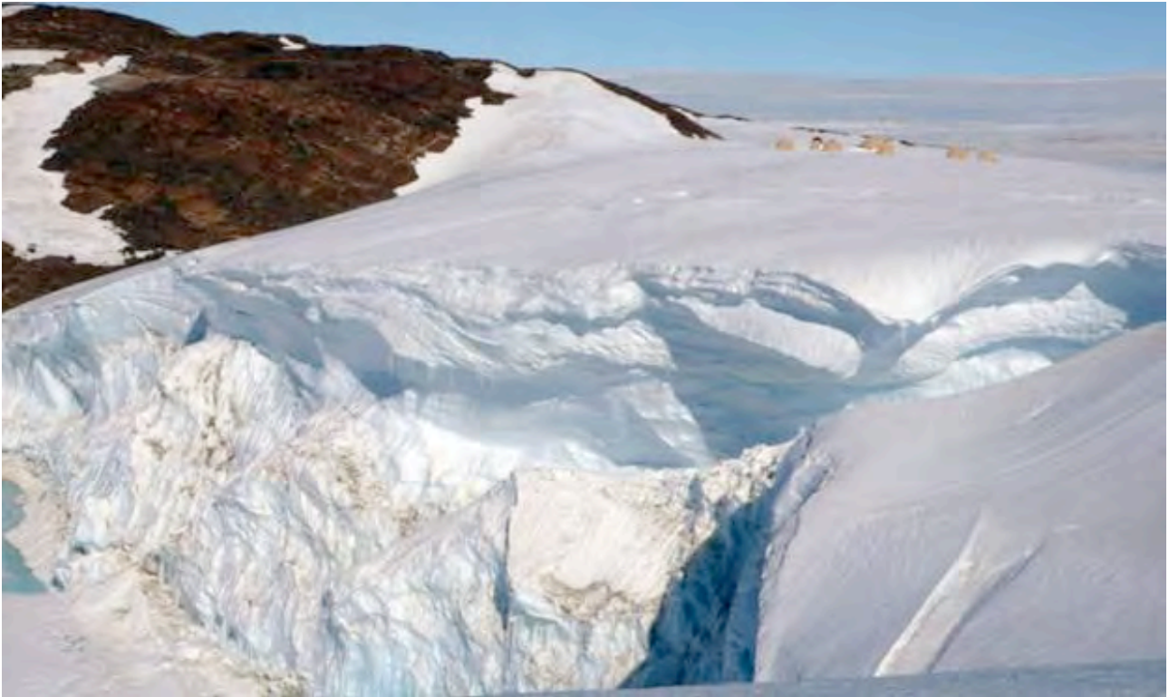
Ice falls in Schirmacher Oasis

We continue our trip by a 3 hour trekking tour to the edge of the Oasis. This is also the edge of the Continent. Further on stretches a shelf ice. At the edge of the Oasis Adelie penguins are often breeding and if you are lucky you will have a close look at these fascinating, funny birds. Those who love cold-water bath can plunge into one of the lakes. For those who travel at the end of December and January we also plan to visit ice grottos, a frozen world of shining blue. We will be back in time for a delicious dinner and nice talks in the evening.