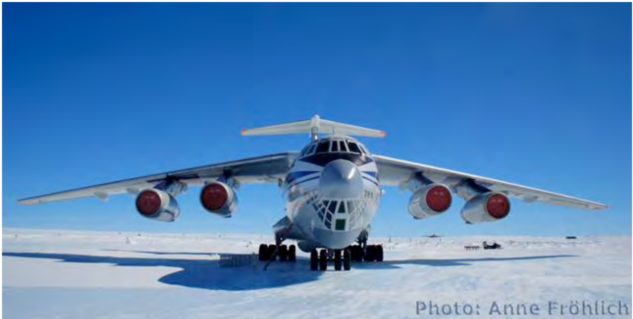
Iljushin 76 in Antarctica