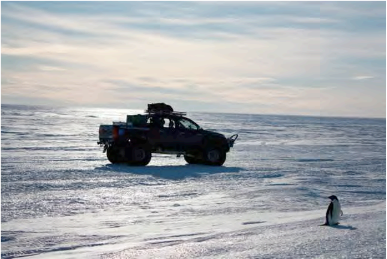
Toyota on its way to the ice barrier

Ice barrier is a place where icebergs calve from the edge of a shelf ice and start their way across the Southern Ocean. Here you have a big chance to see penguins and seals. To the North from the barrier you will see giant icebergs shading the horizon. Later in the season Antarctic vessels come to the barrier to unload cargo for scientific bases. We will have a travel lunch en route.