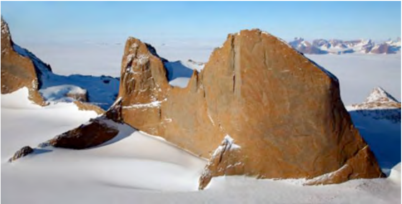
Queen Maud Land mountains. Aerial view

immense scale and beauty. We plan to land in the mountains to have a close look at this unique Antarctic landscape.