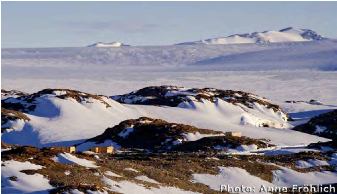
Guesthouse in the Schirmacher Oasis, Antarctica

The wooden houses of the guesthouse complex are cozy and offer all the comfort needed in Antarctica : heated rooms for 1 to 5 people, a kitchen, electricity, warm water, a shower for sharing, toilet facilities and a Russian sauna. After arrival we will show you to your room and you can have some rest after a long overnight flight.