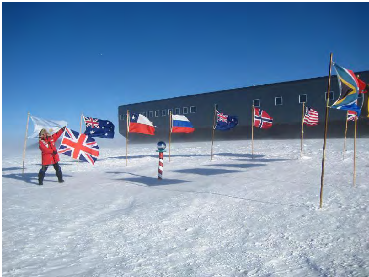
Explorers at the South Pole

At 83 degrees South we land for a refueling. An altitude here is 2,500 meters above sea level. But air in Antarctica is less dense and this elevation equals to 3,000 meters in usual mountains. Refueling will take about 40 min and you will have time to get out of the plane and stretch your legs. It is still 800 km (or 3 hours flight) to the Pole from here. After refueling we continue our flight to the South Pole. During 7-hour flight you will see the Antarctic Continent from the air, getting a rare appreciation of its immense scale and beauty. We land on a runway of the American Amundsen-Scott South Pole research station. The station takes its name from the first explorers to reach the South Pole: Norwegian Roald Amundsen and British Capt. Robert Falcon Scott. On arrival we will complete a Round-the-World trip, walking around a symbolic pole at the Earth's axis, and celebrate our achievement.