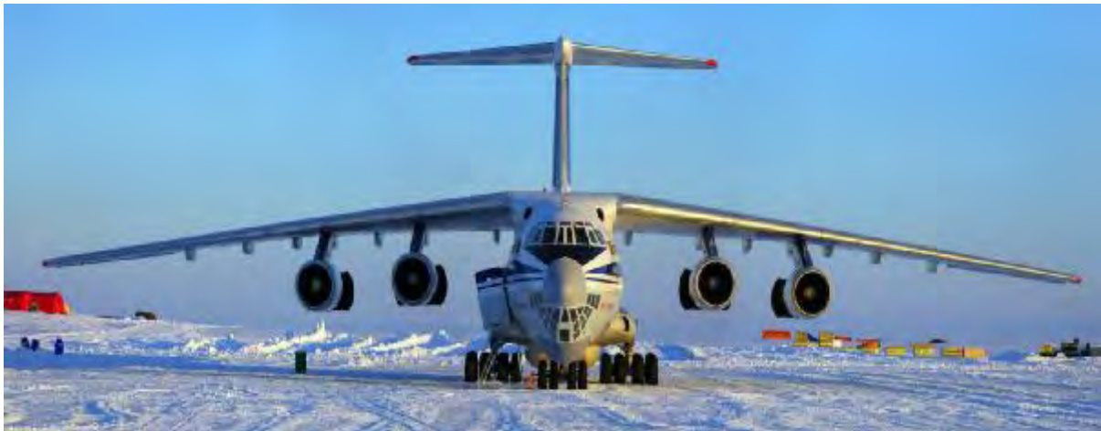
IL-76 at Novo runway

Continuing your flight south you will see (if the weather allows) your first icebergs. This signals the time to get dressed into your polar clothing. The IL-76 jet will arrive at Novolazarevskaya Airbase runway at approximately 03.30am local time (GMT). We land on the blue ice runway.