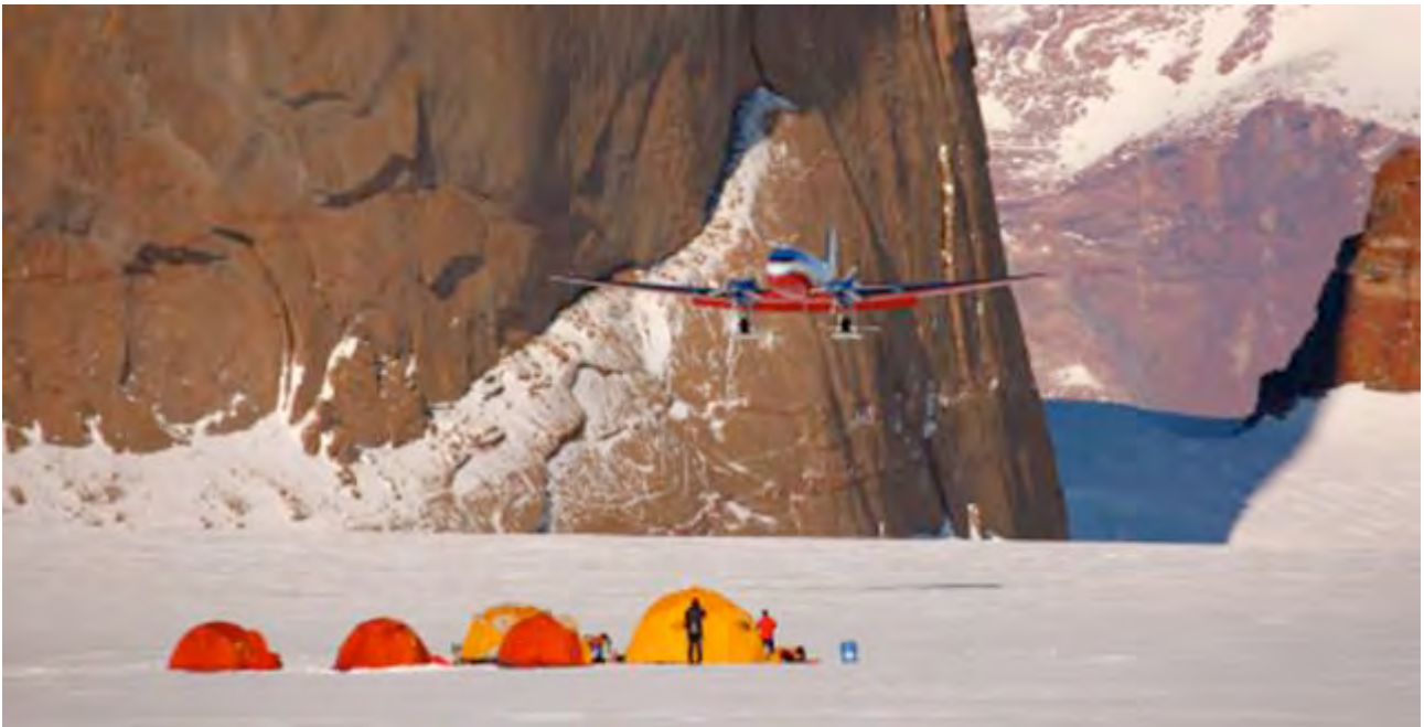
BT67 airplane near Holtanna Mountain

After we dismantle the camp a two-hour flight will bring us to the Emperor Penguin Colony. The flight will give you a unique opportunity to see the stunning mountain ranges of Queen Maud Land from above. So keep your camera prepared!