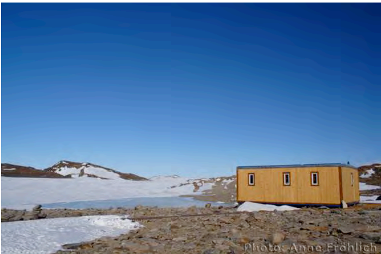
Guesthouse "Oasis", Antarctica

The wooden houses of the guesthouse complex are cozy and offer all the comfort needed in Antarctica : heated rooms for 1 to 5 people, a kitchen, electricity, warm water, a shower for sharing, toilet facilities and a Russian sauna. After arrival we will show you to your room and you can have some rest after a long overnight flight.