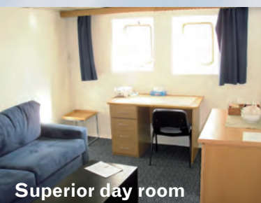
Superior day room

“Ortelius” offers a comfortable hotel standard, with two restaurants, a bar/lecture room and a sauna. Our voyages are primarily developed to offer our passengers a quality exploratory wildlife program, trying to spend as much time ashore as possible. As the number of passengers is limited to approximately 100 on the “Ortelius”, flexibility assures maximum wildlife opportunities.