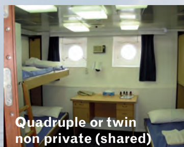
Quadruple or twin non private (shared)