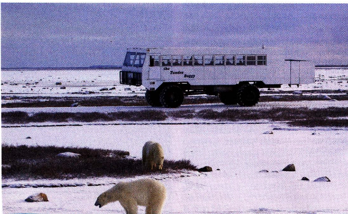
Eisbärenbeobachtung in der Hudson Bay

Anzahlung € 500,- zahlbar bei Erhalt der Buchungsbestätigung. Restzahlung bis 60 Tage vor Reisebeginn. Rücktrittskosten: bei Rücktritt bis 30 Tage vor Reisebeginn 50%